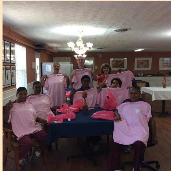
Thank you Housekeepers! You are Awesome!